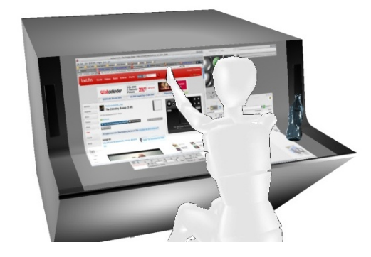
Figure 1. The Curve concept combines a horizontal and a vertical interactive surface, merging physical and virtual desktop.

In today's computer use at desks a dividing line exists between the physical work environment on the (horizontal) desktop and the virtual work environment on the (vertical) computer screen. Most human-computer interaction is done by means of keyboard and mouse combined with a vertical screen. For interacting with the physical world on our desktop hands, fingers and pens are the primary tools. Various research prototypes have tried to merge physical and virtual work environments [1, 2, 7] on digital, horizontal screens. As horizontal and vertical surfaces have complementary advantages and disadvantages they are not interchangeable. On the one hand, vertical surfaces are well suited for displaying information but less practical for manual (touch-)interaction. On the other hand, horizontal surfaces facilitate direct manual interaction with virtual and physical objects while making it difficult to work with different documents at the same time. In the following we describe the design of an interactive surface supporting those properties and our findings of its ideal size based on an initial exploratory study.