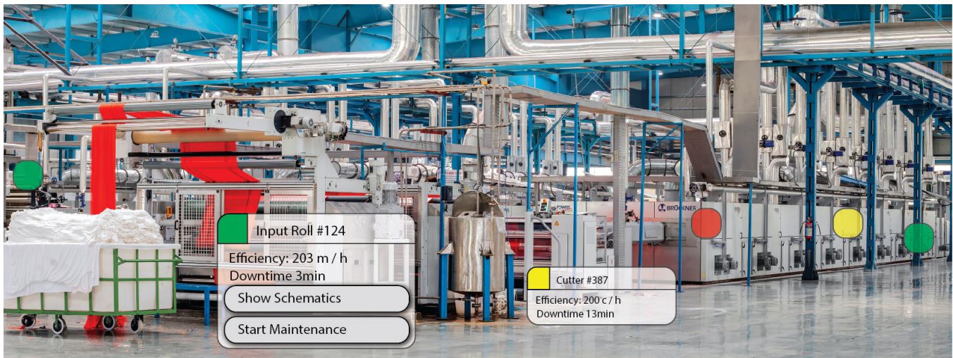
Figure 2: Sketch of a smart factory maintenance scenario with different levels of scaled information shown to a user. While the worker maintains close proximity, more machine information and relevant interaction opportunities are available. The worker can see other machines in the distance with stack light indicators of their operational status.

critical due to the restricted working space. The Identity dimension is one where information type is pre-filtered for a specific user's working tasks [12] – in Figure 2, a maintenance worker.