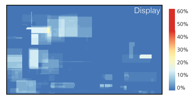
Figure 4. Levels of occlusion of digital objects (documents and widgets) by physical objects (passive and hybrid). Blue: display occluded less than 5% of the time. Yellow: 10%. Orange 20%.

a session's duration (white/yellow spots in fig. 4). This heavy occlusion zone is surrounded by an area with occasional occlusion (light blue). The Interaction area at the bottom of the screen where participants placed objects which they needed often (keyboard, pipette, pen) is the second area with occlusion. In this area, participants made an effort to limit the number of digital elements in order to avoid occlusion and to avoid triggering false touch events when dropping or grabbing physical items<sup>4</sup>.