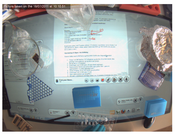
Figure 1. Top view of eLabBench, as recorded for data collection.

http://dx.doi.org/10.1145/2512349.2512794