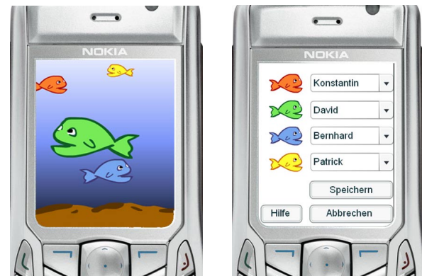
Figure 2. A screen saver where coloured fish are mapped to contacts and the corresponding configuration dialog. Parameters like speed, size and direction of the fish can be used to show communication patterns.

The flowers of the two designs in the centre of Figure 1 are similar in concept to the fish in the aquarium. In the basic version, only the size of the flower is used to represent the communication activity with the respective person over the last weeks. In the setup screen, a contact can be assigned to each flower. The scene includes a sun that is used to communicate further information. A setting sun can be mapped to specific communication events; similarly the intensity of the sun is a further parameter that can be mapped to information (e.g. overall communication behaviour or battery status).