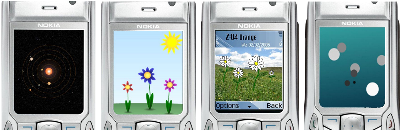
Figure 1. Four designs of screen savers on mobile phones. Each can be used as an abstract way of showing information about frequency and length of calls to certain contacts. A contact is mapped to a planet, flower, or disc, respectively. Users can then get an idea of frequency and length of phone calls at a glance by looking at size and speed of the objects.

have not yet been read. In the case of an incoming message or call, the screen is used by the application, usually to show the caller's ID, contact information, or picture.