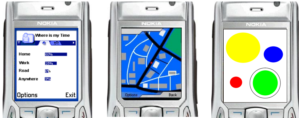
Figure 3. Three designs that show how much time people spent at specific locations. The leftmost application shows a list with percentages that can be explicitly opened through the phone’s menu. The other two designs are screen savers that highlight important locations on a map or visualise long stays with larger coloured circles.