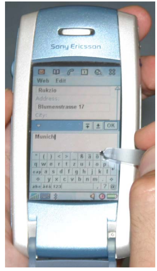
Figure 1. Screenshot of our mock-up web application and activated virtual keyboard

In booth versions the first name, last name, address, city, ZIP, phone number, e-mail address, method of payment, card number and expiration date have to be filled in, accepted or corrected.