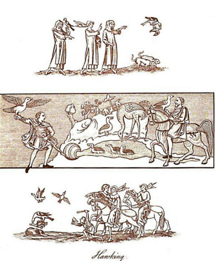
Figure 2: Trained birds have been an important element of hunting for many centuries. This craft originated from China and spread all over the world and various cultural contexts. In addition to the practical character of the bird, it also functions as a status symbol representing the power and influence of the owner. | Joseph Strutt "The sports and pastimes of the people of England from the earliest period" (1801). wikimedia.org