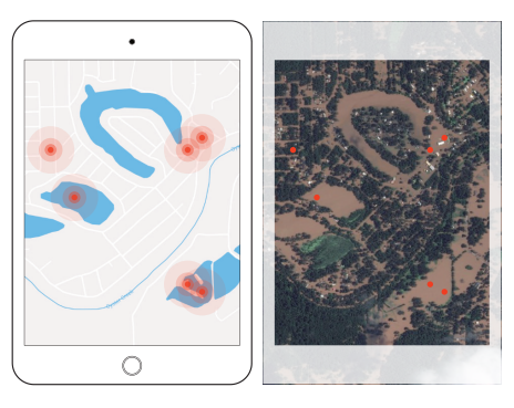
Figure 5: During catastrophes map material can differ drastically from the situation on site. Therefore, the assignment of drones indicated on GUIs with drones seen in the field may turn out to be difficult to almost impossible. Selecting drones with gaze could turn out to be beneficial in such situations.

cause map materials to become unrecognizable (see Figure 5). Missing landmarks, covered by water, snow or mud, as well as destructed reference points as prominent buildings hinder the orientation on GUI based systems. In such scenarios selecting, controlling and commanding drones by gaze direction can be useful as well as indispensable. A conceivable example would be the selection of a specific drone to watch its video stream on a portable monitor during rescue. This could be useful for searching for survivors of avalanches of floods in inaccessible areas.