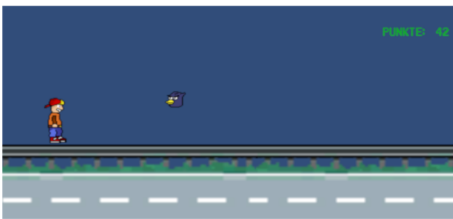
Figure 1. Arch'n'Rune: Facial expression recognition is used to control the avatar. The game is set on a guardrail either using a live camera of the current view (above) or a neutral blue background (below).

In the following, we first describe a pilot study, which we conducted to learn more about children's behavior on long car journeys. Afterwards, we present our Jump'n'Run game and report our insights from exploring the game with children. Finally, we discuss our findings and give implications for future facial recognition games in cars.