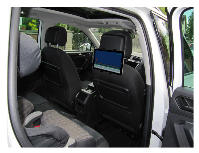
Figure 3. Study Setting.

We developed two different versions for the background of the game (cf. Figure 1). The first version uses a live video of the car's surroundings for the background. The video is created by an external web cam outside of the car, connected to the device displaying the game. We expect that this background prevents children from suffering from motion sickness since it has the same effect as looking outside the car's window. The second version uses a simple blue background. Finally, the game includes a tutorial, which explains the basic movements and allows the player to practice the movement.