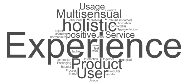
Figure 2: Word cloud illustrates the number of mentioned nouns, adjectives and verbs which were used to define the personal understanding of UX, collected by an anonymous survey in a design agency.

In order to understand which disciplines are involved in UX processes we asked 11 UX researchers and 13 UX practitioners over the course of one week to present their perspectives on UX design. It is notable that all academic participants regularly publish at HCI conferences and the interviewed practitioners represent perceptions from established firms and startups.