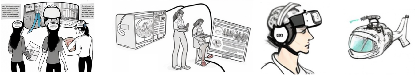
Figure 1: This paper explores the limitations of current Mixed Reality (MR) experiences and how physiologically-adaptive systems can optimize interactions and enhance user experiences in various domains, such as healthcare, education, and entertainment. Physiologically-adaptive systems have the potential benefit of providing users with more personalized and engaging experiences. However, addressing ethical and privacy concerns is a fundamental issue in the HCI community when dealing with implicit systems and inputs over which users have limited control.