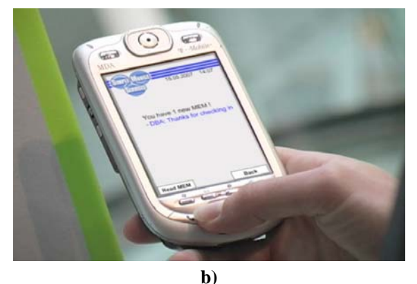
Figure 3: Using an SMS-point for interaction with a check-in service (a) and confirming the transaction with an MEM (b)