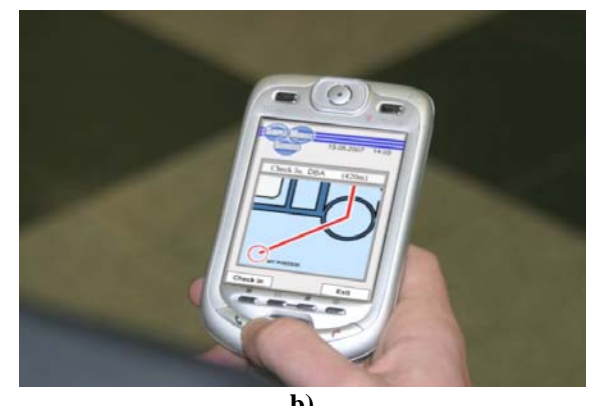
Figure 2: An MEM providing details about a flight (a) and showing the way to the next check-in terminal (b)

The SMS system uses prominent objects such as check-in terminals as SMS points (Figure 3a). These are special, interactive locations or objects in an SMS network. They support technologies such as NFC, RFID, Bluetooth or WiFi in order to provide special, service-related functionalities like user authentication, access control or payment. Mobile SMS clients can detect and communicate with SMS points as well as with associated services. SMS points can facilitate the invocation of associated services. Instead of complex interactions, users can simply submit their MEM to a service using their mobile devices and technologies like NFC or Bluetooth. As the result of a transaction, the user receives another MEM (Figure 3b).