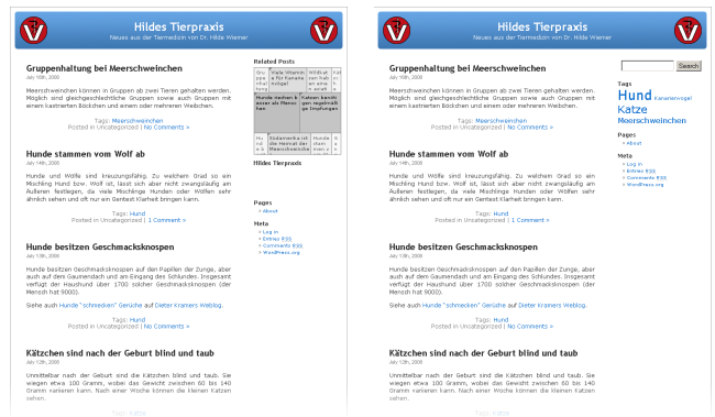
Figure 2: During the user study, participants completed tasks by using either the Trackback Map or a search form together with a tag cloud (see trackback-map.medien.ifi.lmu.de ).

Each of the fifteen participants received a questionnaire that was divided into three parts: Personal data, five tasks, and final feed-