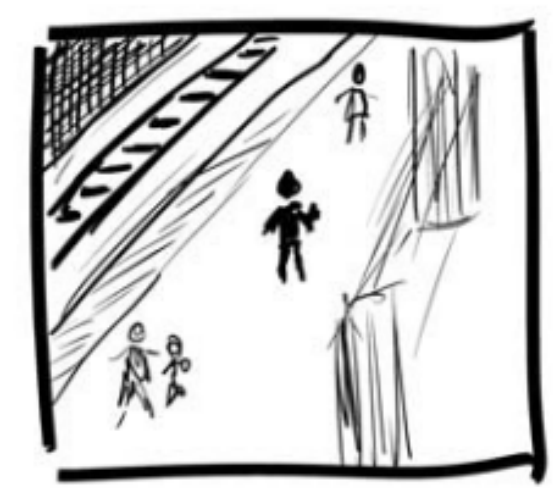
Extreme long shot (wide shot)

A view showing details of the setting, location, etc.