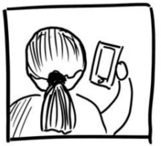
Over-the-shoulder shot Looking over the shoulder of a person.