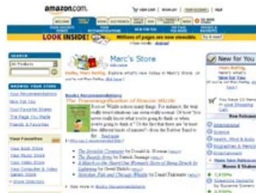
figure 1. Insert a caption below each figure. Use the "caption" style to format the text.

If you aren't familiar with Word's handling of pictures, we offer one tip: the "format picture" dialog is the key to controlling position of pictures and the flow of text around them. You access these controls by selecting your picture, then choosing "Picture..." from the "Format" menu.