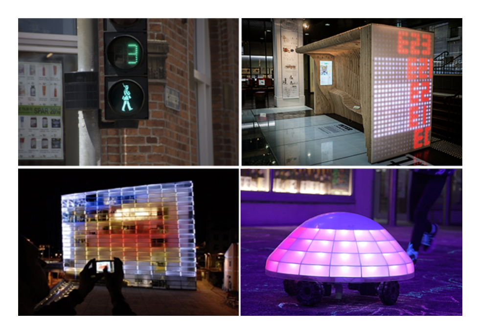
Fig. 4. Examples of urban interfaces in various application contexts to illustrate an increasing complexity: from simple traffic lights (top left), to mediated city infrastructure (top right), large-scale media facades (bottom left), and robotic urban displays (bottom right).