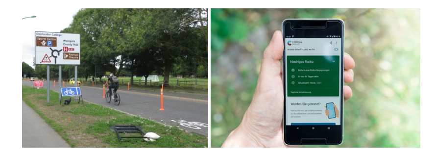
Fig. 2. Pop-up bicycle lanes in the U.K. (left) and a user interacting with a mobile virus warn app (right) as a direct consequence of an immediately changed behavior due to a pandemic.

As an interdisciplinary field and community of practice consolidating Interaction Design (IxD), Architecture, Human-Computer Interaction (HCI), and practice-led urban prototyping [30], media architecture has long been dedicated to the responsible integration of new technologies and digital media into cities. Hence, in light of these new challenges, we argue that media architecture can and should provide a solid foundation of lessons learned and methodological insights offering guidance in asking the right questions and delivering responses to this radical shift. We believe that a deeper reflection on each field's role individually and concerning the other areas can provide directions on creating meaningful dialogues between people, the built environment, and emerging technological entities living in changed urban realities. Although the changes initiated through these particular circumstances might be temporary, similar rapidly shifting crises at the city, regional or global level are regularly emerging, such as, for example, displacement caused by natural disasters, social upheaval, climate change, and the global refugee crisis. Based on that, we posit that the need to react to novel global challenges quickly will be a persisting phenomenon for the next decades, demanding technological means and prototyping strategies to respond and ensure urban resilience adequately.