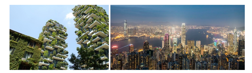
Fig. 3. Example of an eco-friendly architectural design in Milan (left) and lighting pollution in Hong Kong (right).

the role of HCI in this new urban reality. As we are confronted with novel design challenges, the question persists on how these can be addressed and linked to current design demands, such as designing an eco-friendly built environment and urban lighting overuse (see Figure 3). The abovementioned paradigm shift within media architecture also often includes new types of ubiquitous design materials distinguished from previous standard choices such as LEDs, large urban displays and projections, as the manifestation of digital media is no longer limited to stationary and fixed positions [27]. We believe that a research-through-design approach [68] is suitable to address the challenges mentioned above. It accelerates the creation of insights and knowledge on user acceptance in this emerging domain [68].