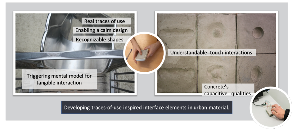
Fig. 5. Example of a human traces of use at a playground shown through colour differences (left) and UI elements inspired by this metaphor (right) realized using concrete, each in an abstract (top row) and in a used version (bottom row).

We presented the novel idea [26] of applying traces-of-use-inspired interfaces in urban environments. This design concept's metaphor was chosen as urban traces captivate due to their ubiquity, recognizability, and simplicity. Our design approach aims at augmenting the built environment with calm technologies. Furthermore, our work includes creating a universal design language for input modalities based on