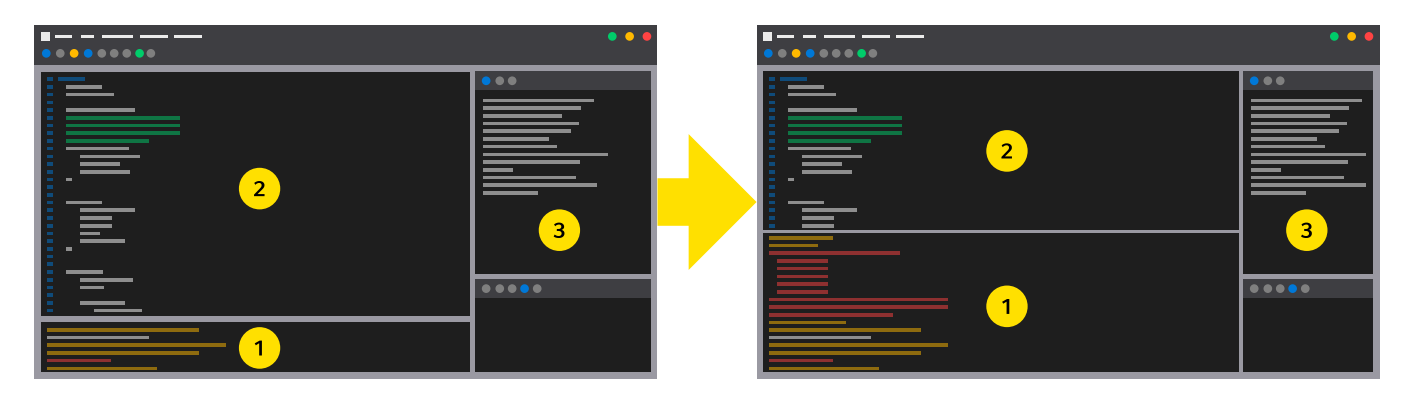
Figure 1: Our gaze-based adaptive IDE extension changes the layout of the IDE depending on the developers' intent. For example, when the prediction models determine an increased relevance for the terminal output in the IDE (1), the code editor (2) and other UI elements (3) shrink while the output panel (1) grows in size. This can highlight or reveal otherwise missed information.

Sven Mayer LMU Munich Munich, Germany info@sven-mayer.com