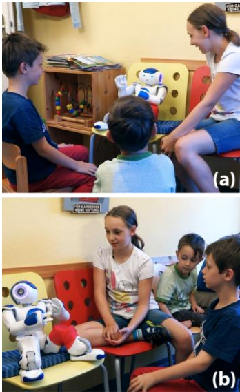
Figure 1: Children interacting with Murphy Miserable Robot in a waiting room scenario. Scripted Scene with child actors.