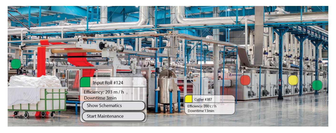
Figure 2: Sketch of a smart factory maintenance scenario with different levels of scaled information shown to a user. While the worker maintains close proximity, more machine information and relevant interaction opportunities are available. The worker can see other machines in the distance with stack light indicators of their operational status.

critical due to the restricted working space. The Identity dimension is one where information type is pre-filtered for a specific user's working tasks [12] – in Figure 2, a maintenance worker.