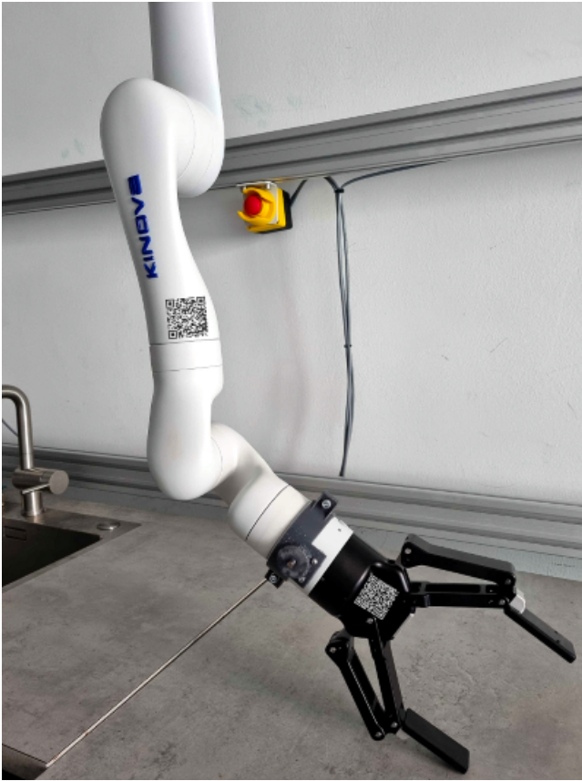
Figure 1: Physical tooltips in the form of QR codes on a Kinnova robot arm.

website with explanations. By utilizing phones as an assistive tool in making robots self-explaining, other modalities like audio output are possible. QR codes (Quick Response codes) are 2D matrix codes which store information, commonly used to encode URLs [15]. We selected QR codes for our showcase as they by nature compress larger amounts of information in a small space, which is ideal for adding them to other systems. Further, due to the prevalence of QR codes e.g. when accessing menus at restaurants or signing up for a corona test, even non-expert users have become aware of their functionality during the last few years. Users know that by scanning QR codes with their phone camera they receive additional information. Thus, QR codes seemed like an appropriate means to indicate to user that they can acquire further information. Due to the ubiquity of smartphones, anyone interacting with a robot can thus have access to this further information, making the robot in essence self-explaining. Of course, this is only a technical solution which allowed us to build a working prototype and explore our concept with little effort and today's technology. In the future, such explanations might be displayed in the field of view of AR glasses, retina implants, or whatever other technologies might emerge. The challenge will then be to appropriately and unobtrusively signify the fact that additional information is available.