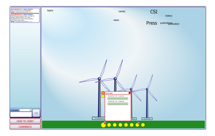
Figure 2. GridOrbit's public display with 3 machines connected.

Our second project is GridOrbit , a public awareness display which visualizes the activity of a community grid used in a biology laboratory (Figure 2). This community grid executes bio-informatics algorithms and relies on users to donate CPU cycles to the peer-to-peer grid. The goal of GridOrbit is to create a shared awareness about the research taking place in the biology laboratory. This should promote contributions to the grid, and thereby mediate the appropriation of the grid technology. Our contextual analysis for GridOrbit sought to understand sharing and collaboration habits for molecular biologists while working in the lab. Our methods included place-centered observations, task-centered observations, and interviews.