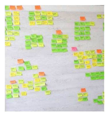
Figure 2: Final stage of the affinity diagramming process, which helps to create a mental model of password managers. The most prevalent topics that contribute to sense-making of password managers were Creation, Organization, Commitment, Log-In, and Individual Perceptions.

ments and tend to behave insecurely in favor of better usability [8]. For example, to alleviate the challenge of maintaining dozens of user accounts [4, 5], users re-use their credentials [3, 13] and/or choose easily memorable but predictable passwords [1], so data breaches become even more severe. While companies can enforce security policies, private users develop their own strategy for password management and account administration. Not only the creation of sufficiently strong passwords meeting composition policies, but also recalling the right ones is a challenge. Software for managing this information is intended to help users with this problem. However, password managers ( PWM ) are still underused ( \approx 12\% of users) and most users ( \approx 86\% ) report to memorize passwords<sup>1</sup>.