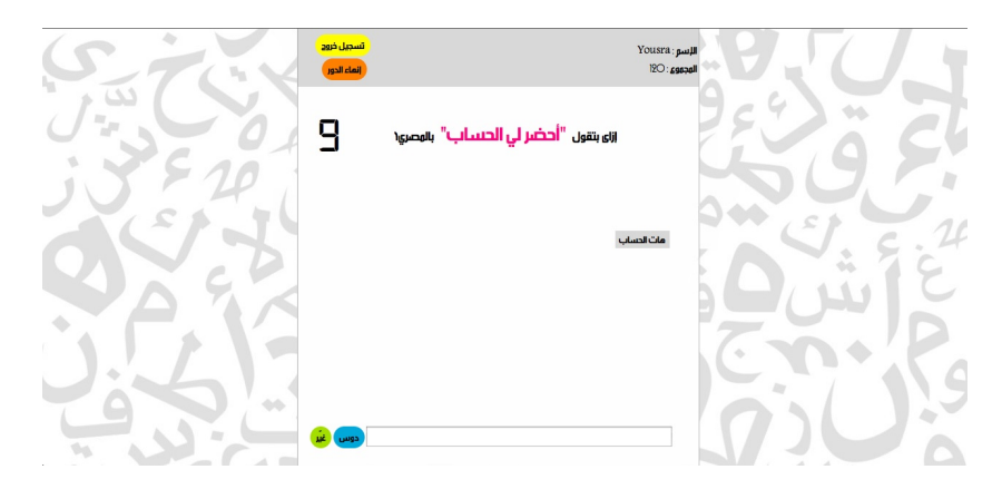
Fig. 1: The player's perspective after providing one guess

We developed a Game With A Purpose that provides players with phrases in MSA, and asks them to guess corresponding ones in the Egyptian dialect (see Figure 1). The more frequent a guess is matched, the higher the score the player gets.