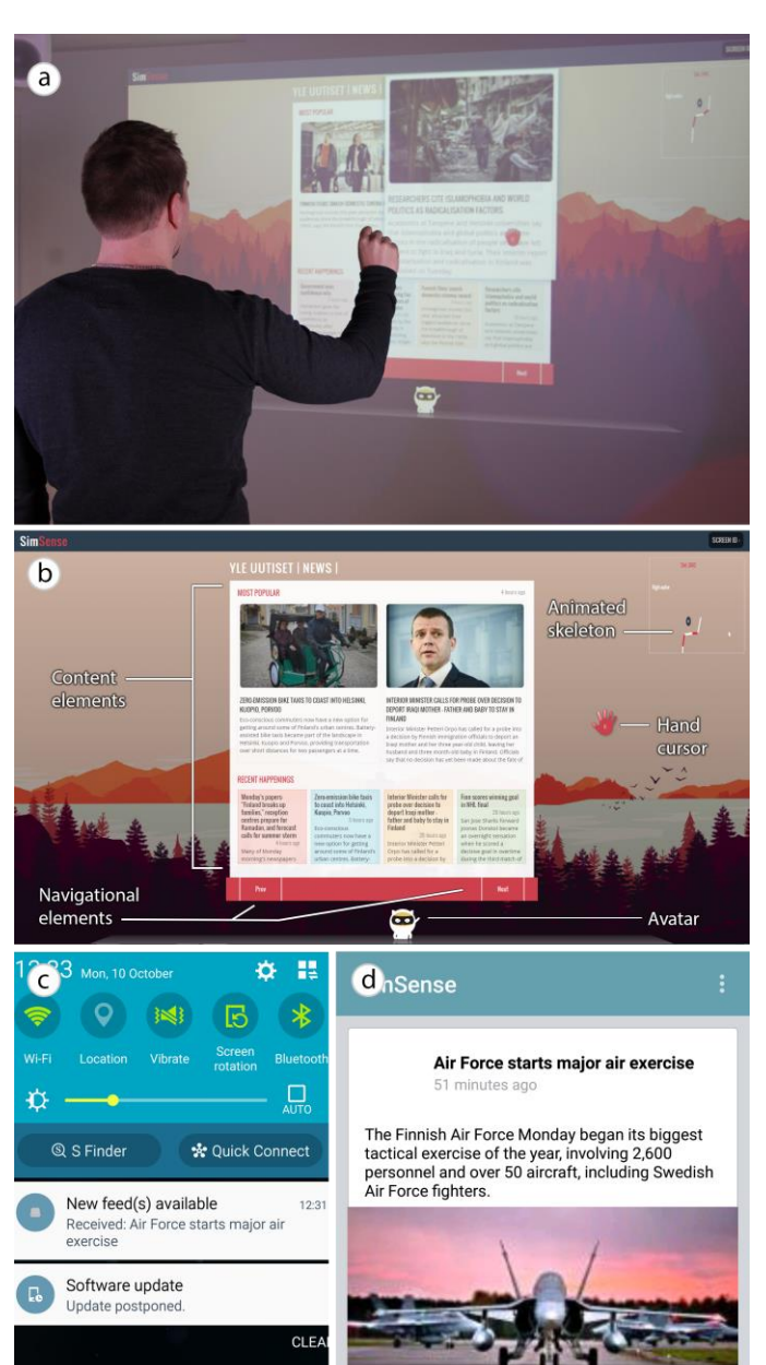
Fig. 1. A) A user is transferring content from the large information display to his mobile device by performing the grab-and-pull gesture. B) An overview of the elements in the large display application. C) "New feed(s) available" notification on the mobile device about received content. D) The SimSense mobile application displaying content that was transferred from the large display.

<sup>1</sup> https://youtu.be/RkpjCsNBu3U