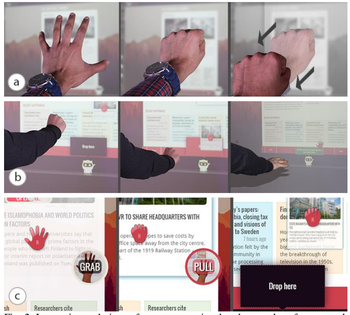
Fig. 2. Interaction techniques for content retrieval and examples of contextual feedback. A) Grab-and-pull: 'grab' and 'pull' an element from the screen. B) Grab-and-drop: 'grab' content and drag and drop it onto a drop area. C) Left: an animated icon visualizing a 'grab' gesture when a transferable element is being hovered. Middle: an animated icon visualizing the 'pull' phase of grab-and-pull after the user has grabbed the corresponding element. Right: with grab-and-drop, a drop area is generated on top of the user's avatar when an element has been grabbed and can be moved around the screen.

With grab-and-drop, a drop area is generated on top of the user's avatar when an element is grabbed. The user then drags the grabbed element into the drop area and releases the grab, after which the content is transferred [Fig. 2B].