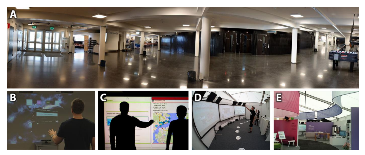
Figure 1. Public displays and their locations. A) Panorama of the deployment location for Information Wall from the installation's perspective. Cafeteria on the far left, auditorium on the far right. B) Information Wall. C) Information Wall 2. D) EnergyLand. E) The deployment location for EnergyLand at a housing fair. The installation is at the far back of the room.

The second deployment, EnergyLand , is a gesture-based system for initiating conversations on novel energy-efficient solutions for smart homes. Users interact with virtual objects in game-like tasks to understand ways to incorporate green energy practices inside their homes (Figure 1D). EnergyLand was a part of a Smart House installation at an annual Finnish housing fair in summer