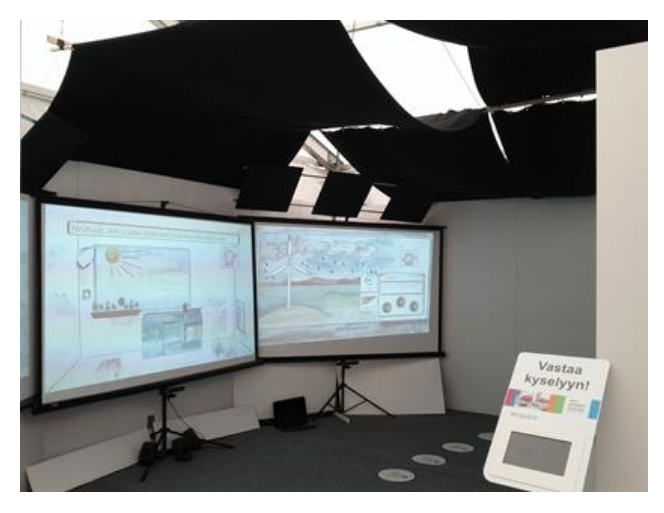
Figure 3. Curtains hung above the EnergyLand installation to prevent issues with sunlight.

Ackad et al. [2] also reported two issues with sunlight with their outdoor gesture-controlled display. Sunlight interfered with the sensors, as well as hindered the visibility of screen content. They adapted to the issues by only running the system from 6 pm until midnight, when sunlight no longer hit the deployment space. Similarly, Fischer and Hornecker [25] only ran their media façade system after dusk, since the projections were not visible enough in daylight. Harris et al. [31] reported varying visibility with their screen in an outdoor setting, and added hoods to the screens to minimize the effect from external lighting. Likewise, Ojala et al. [54] report low visibility with their UBI-hotspots in direct sunlight, however this issue was ignored.