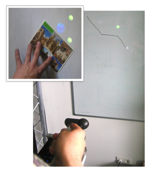
Figure 3: LittleProjectedPlanet game screenshot: A user playing the game with a postcard (upper left corner). User is sketching a marble run and projected tennis balls are bouncing on it (center).

lab. First mobile setups were presented by Hang et al. [11], Tamaki et al. [17] or Schöning et al. [15]. From this development a rich design space for mobile games could emerge. Actual mobile games are characterized by simple graphics and miniaturized input modalities. That is why many mobile games are just played when the user wants to overcome a period of unused time. With a built in projector not only the graphical resolution of the games can be increased, also the possibilities to develop mobile augmented reality games will improve. To create visual overlays for augmented reality games, in the past often head mounted displays where used [8]. This retrenched not only the comfort of the user it also limited the mobility. As a consequence of the display being attached to a single player, games using a head mounted display can only be played in multiplayer scenarios when using a large amount of hardware. Another common technique for dynamic overlays is to use the screen of the mobile device like a magic lens [14] and so be struggle again with the small size and resolution. Moreover such a magic lens display is not really enjoyable to use with more than one player at the same time. Projecting a dynamic overlay directly onto a surface of the real world may enhance the playability even though it is hard to identify the overlay