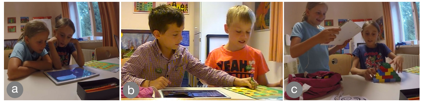
Figure 1. We present TaBooGa, a hybrid reading app that supports children's reading motivation by combining an electronic book with tangible elements. Children read a story on a tablet (a). To progress through the story a figure of the main character needs to be moved on a physical gameboard (b). The reading task is interlaced with real world tasks (e.g., building a bridge with LEGO), which is integrated with the story by taking a picture (c).

<sup>2</sup>LMU Munich Institute of Art Education tina.kothe@lrz.uni-muenchen.de