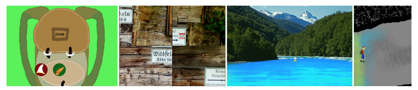
Figure 4. Two digital components support the reading task. First, the contents of the backpack (left) help readers during their task of drawing the monster, by providing hints that were presented throughout the story on the monster's appearance. Second, three mini-games interlace the content to further increase motivation – a puzzle, a skill game, and a navigation game.

purpose is to increase the reading motivation through gaming actions, known to the children from many apps. In particular the games include a cave game, where children need to navigate through a dark cave, a skill game, where children need to fish a bottle out of the water, and a puzzle game, where children need to solve a puzzle depicting a signpost.