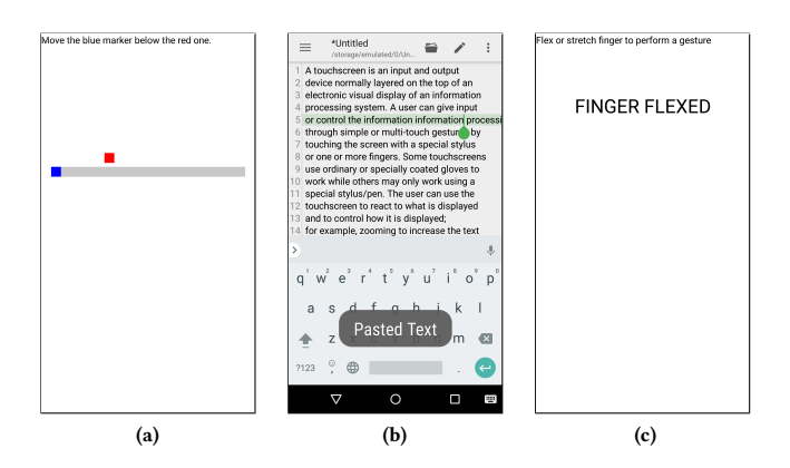
Figure 4: Screenshots of the study application: (a) 1D target selection task for both FlexionTouch and Direct Touch, (b) demo for pasting text using a finger-flexion gesture, and (c) abstract demo for practising finger-flexion gestures.

set the values one-handedly since I have to focus on not dropping the smartphone" - P3).