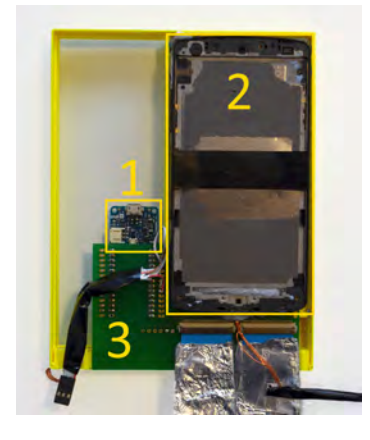
Figure 8: Hardware box containing Arduino (1), two Nexus 5 without touchscreen (2) and PCB (3).