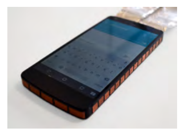
Figure 7: The full-touch smartphone prototype with touch sensing capabilities on the front, back, left, right and bottom side.

In the context of semi-structured interviews, eight participants suggested different interaction methods for a full touch smartphone . Based on their experiences in interaction design, participants argue that these interaction methods are potential solutions to common touch input limitations. Suggestions to deal with the fat-finger and occlusion