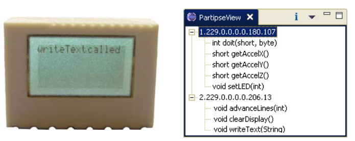
Figure 2: Another particle with a display has been activated. Its interface is added.

Figure 1 : The Eclipse development environment. The view of the plug-in is displayed in the right bottom corner. It currently shows the interface of one particle. The code window shows how to call a method of this particle (including exception handling).