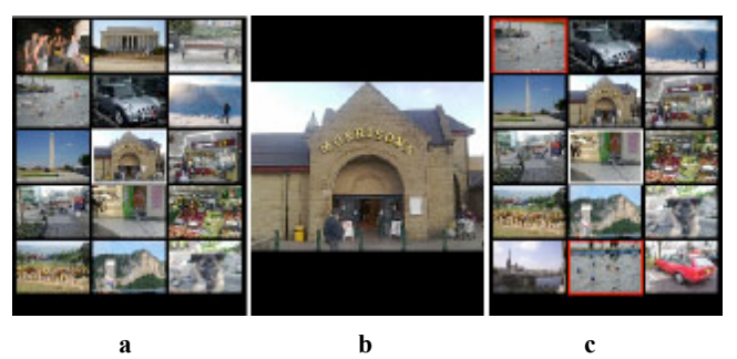
Figure 2. Mobile phone screen only image layout (a), enlarged image (b), multiple image selection (c).

For all three modalities (phone display only, projection only, and projection & phone display) by default the images are displayed as thumbnails in a grid 3 x 5 displaying a maximum of 15 images at one time. A grid of these dimensions was chosen to favor and capture the most amount of content in relation to the mobile phone screen. Figure 2a illustrates the thumbnail layout for the mobile phone.