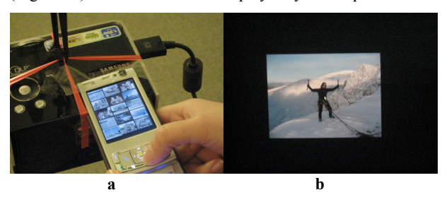
Figure 4. Phone and projection combination (a) thumbnail layout (b) User looking at an enlarged image in the projection.

Figure 4 illustrates the phone and projection interaction technique. Here the user can use both displays in parallel to browse photos. The mobile phone displays the images using a thumbnail layout (Figure 4a) as with the mobile display only technique.