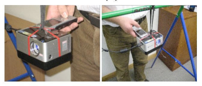
Figure 1. Prototype setup, N95 physically attached to a projector to simulate real use.

The Samsung SP-P310ME is a battery powered hand held projector, coupled with a Nokia N95 it is used to simulate a projector phone. It has a relative size of 12.7 \times 9.5 \times 5.1 cm (w x d x h) and weighs just 700 grams (excluding battery). The projector has a display resolution of 1027 x 768 pixels. Figure 1 illustrates the experimental setup. It can be expected that when using a projector phone the user will be unable to hold the mobile phone completely steady resulting in movement of the projection. For this reason the projector is attached to a frame using elastic to simulate realistic movement of the projection.