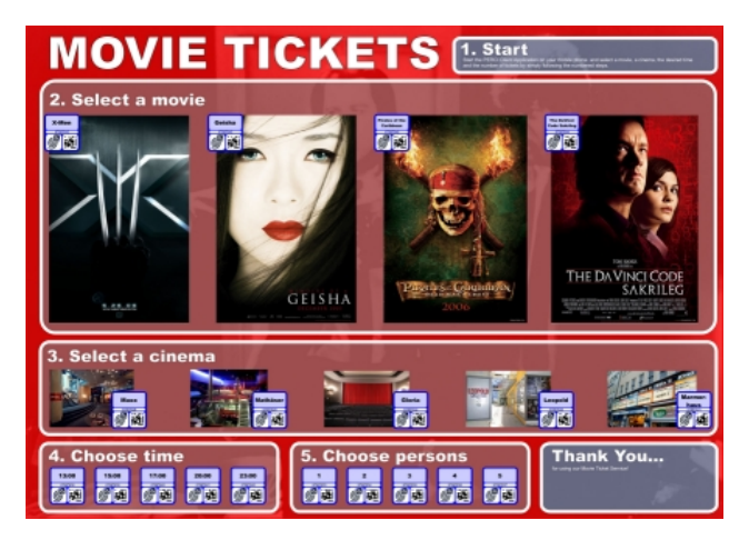
Figure 2: Augmented poster for movie ticketing

The second poster allows users to purchase movie tickets and includes appropriate options (movie title, cinema name, number of tickets and preferred timeslots) together with a selection of values (see Figure 2).