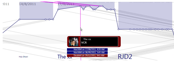
Figure 3: Hovering over an arc or song node shows additional information and a listing of all its instances.

history hop from instance to instance, so, e.g., three identical songs in one history leads to two arcs between them. They have grey color and are symmetrical; their height corresponds to one tenth of the distance between song instances. This makes it possible to see how frequently songs are repeated: Low arcs mean that songs are only repeated shortly after discovering them, while high arcs stem from frequent, long-term repetitions. Inter-history arcs connect the first instance of a song to all instances in the other person’s history. These are colored in pink and have a skewed curvature that leads to an almost vertical initial shape with a long fall-off (see Figures 1 and 2). These differences in color and shape make them visually distinguishable from intra-history arcs and additionally allow seeing in which history a song appeared first – an important feature for determining who has the ‘bragging rights’ for discovering an artist.