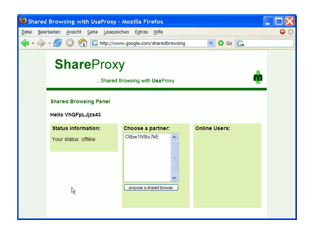
Fig. 4. Overview page for the management of shared browsing sessions. Users can select a partner and send him a proposal to start a shared session.

need to be reconfigured. On the server side, only a simple reconfiguration is necessary: Either the original server needs to listen on a different port to allow UsaProxy 2 to filter incoming requests on port 80, or the website's DNS entry needs to be pointed to a separate server on which a copy of UsaProxy 2 is running.